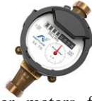
Picture above is a Neptune T-10 meter used in LCWD resident homes.

Water meters are typically installed in basements close to the water supply entrance into your home. LCWD employees need unobstructed access to water meters for testing, inspections, troubleshooting and maintenance. More importantly, this is the likely location for the main shutoff valve for water in your home which must always be accessible for emergency shutoff in the event of leaks. Most meters are now read remotely without the need to access your home. However, if you still have an outdoor reader connected to the meter with wiring, please make sure the wires are well maintained, not cut, severed, or damaged. If any of this takes place, please contact LCWD immediately so that we can come out and make the necessary repairs. Your assistance in this and in maintaining a functioning water shutoff valve prior to the meter is appreciated. If you have any questions about this, please contact us at 781-334-3901.