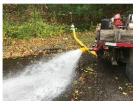
Results after flushing