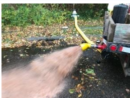
High velocity unidirectional flushing

FLUSHING is an integral part of good maintenance of LCWD's infrastructure. Flushing twice a year scours the pipes for buildup and helps to remove sediment in the pipes. Flushing is done in the spring and fall. Notifications for when flushing will begin are posted on our website and in the local newspaper.